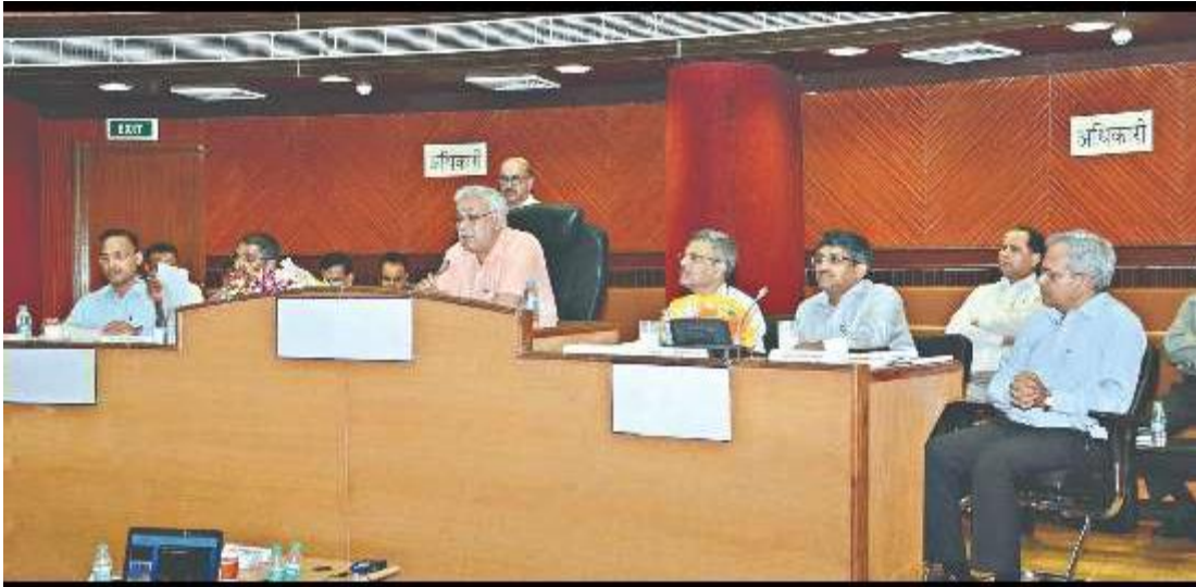
Secretary (HUA) explaining the concerted efforts of Ministry and MCD towards Reforms Implementation & process reengineering in OBPS for MCD. Also present on the dais: AS (HUA), JS (HUA), JS (DIPP) & Municipal Commissioner (SDMC)