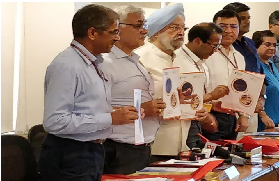
Launching of LAP-TPS Scheme by Hon'ble Minister for Housing and Urban Affairs

TCPO has formulated the scheme and will provide hand holding support to the state nodal agency and implement the scheme through State Governments.