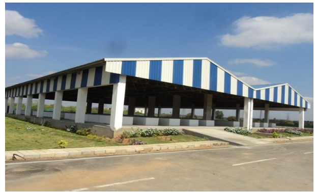
Vermicompost shed and Pre Processing area - Solid Waste Management for Sriperumbudur Town Panchayat under UIDSST