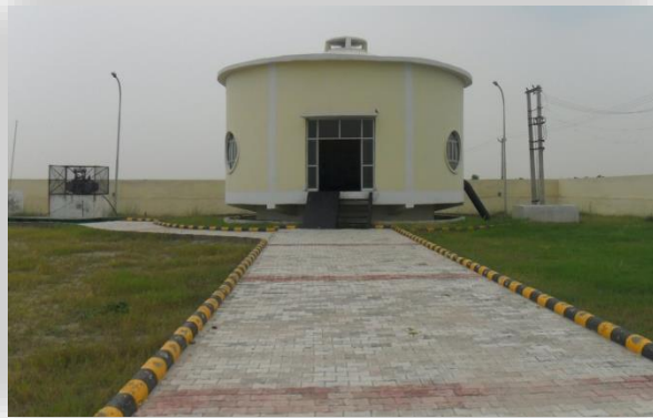
Ranney Wells (Radial Collector well) - Augmentation of Water Supply for Sonapat Town under UIDSST

Vikarabad (near Hyderabad), Sriperumbudur (near Chennai) and Hoskote (near Bengaluru), Sanand (near Ahmedabad). The four components of the scheme are water supply, underground sewerage, solid waste management, and GIS base map and HH survey. 17 projects have been approved, of which 7 projects are completed and 5 projects are more than 80% completed. There are 15 reforms monitored under this scheme. Total amount released so far is Rs.45970.35 Lakhs.