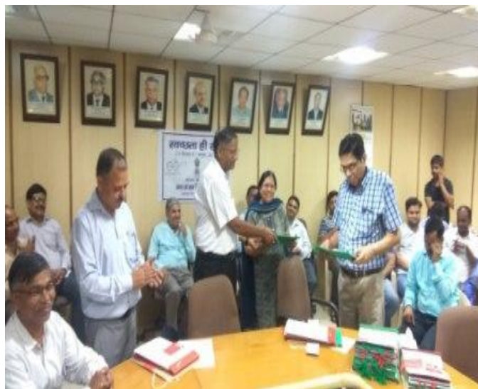
Swachhata hi Sewa at TCPO, including plogging, appreciation certificate distribution for cleanliness initiatives, and tree plantation