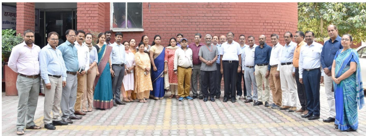
Group photo of the training batch with CMD- HUDCO, ACP-TCPO and other officials from HSMI and TCPO at the inauguration of the 3-week training programme on Good Governance