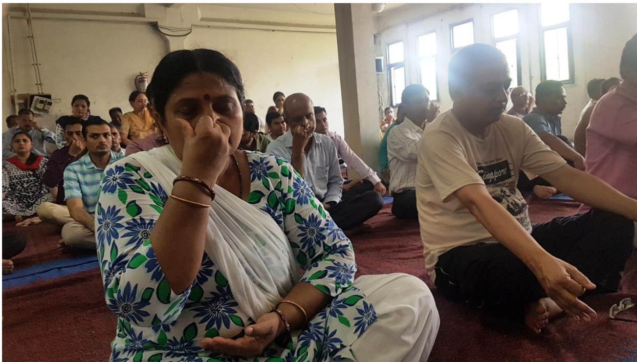
TCPO personnel gather for International Yoga Day celebrations